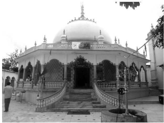
Siddha Purush Bokhari Baba's Shrine, Kaipadar

Khordha the then capital of Odisha, a fortress strategically selected and fortified to repel the continuous aggressions of neighbouring